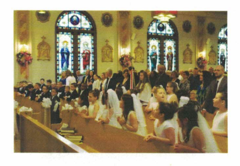
God Bless our 2nd graders! May the spirit of Jesus live within you.

Follow us on Instagram - @sskschool Like us on Facebook - St Stans School Sayreville Visit us on our website - sskschool.org