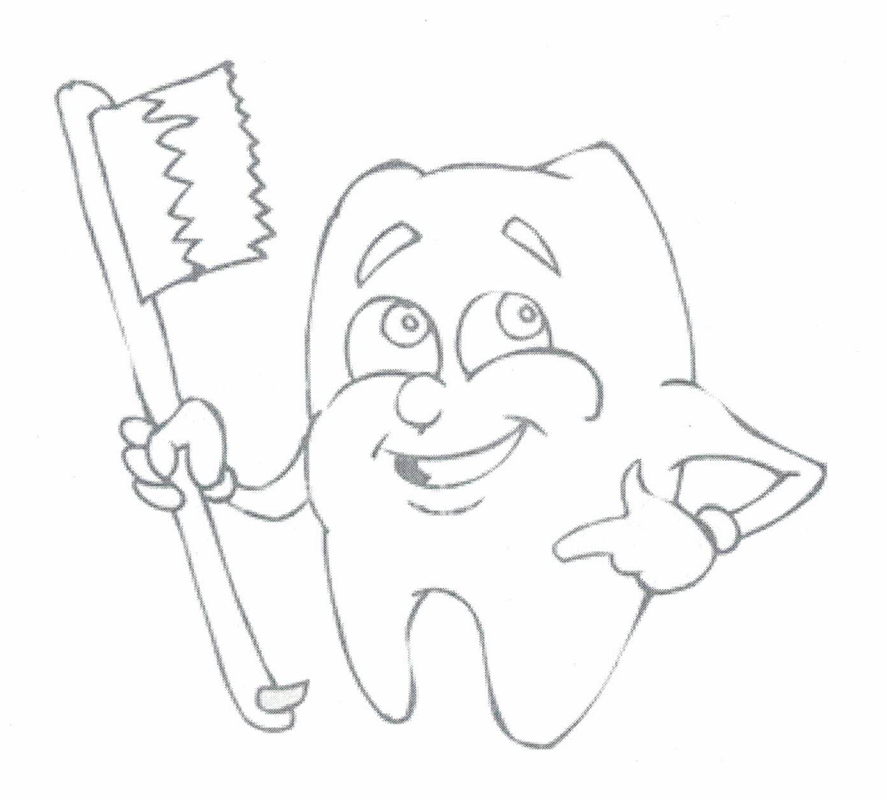
December 11, 2015